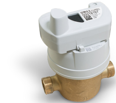
Aquadis+ equipped with the Cyble 5 module